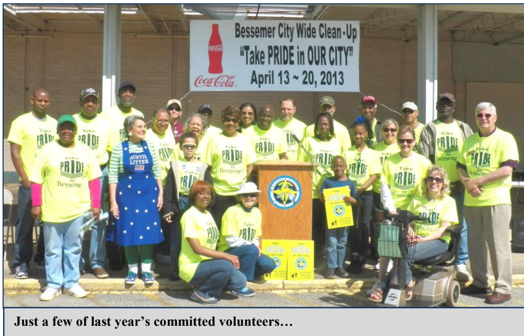
Just a few of last year's committed volunteers...

With the kickoff on Monday April 21 st the city wide 2014 Clean-up Bessemer Campaign begins. The Chamber is partnering with our local schools during the week to encourage our children to keep our city clean. This is part of the City of Bessemer and Chamber program: Take PRIDE In Our City, and will run from April 21 st through the 26 th . You are encouraged to first clean up your own business site, then the block you are on, then help with the city clean up. You can pick up garbage bags, t-shirts, and register for clean up of a specific area. For more information call the Chamber at 424-3253 or email mmilan1@bellsouth.net or go to www.bessemerchamber.org .